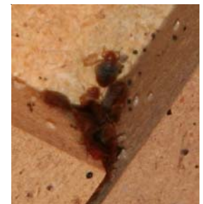
Bed bugs in crevices