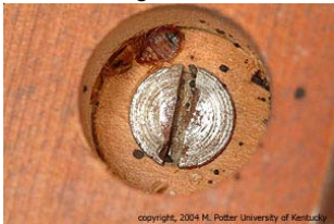
(M. Potter, Univ. of Kentucky)

Bed bugs hidden beside a recessed screw under a nightstand.