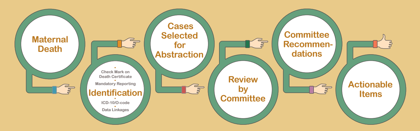
FIGURE 1: OVERVIEW OF THE MATERNAL MORTALITY REVIEW PROCESS