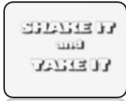
Shake it & Take It