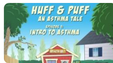
Huff & Puff