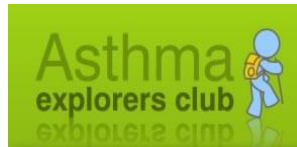
Asthma Explorers Club