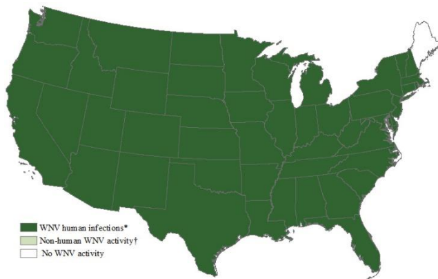
Figure 2: West Nile Virus Activity by State – United States, 2017 (as of January 9, 2018)

Eleven horses tested positive for WNV in 2017, and 7 horses tested positive for EEE. In 2017, 5 birds were submitted for testing from one county; 1 tested WNV+. A total of 6418 pools of mosquitoes (119735 individuals) were sent for testing with results reported to the GDPH. Three species were found to be WNV+, Culex nigripalpus (2 pools), Cx quinquefasciatus (262 pools) and Cx restuans (1 pool). There were also 11 pools of unspecified Culex spp found WNV+. Two EEE+ pools were reported from Culiseta melanura in 2017.