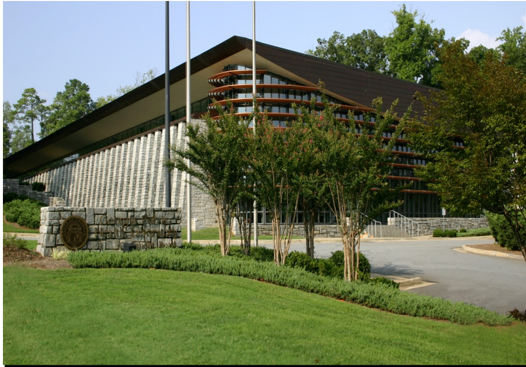
GPHL – Decatur established in 1997