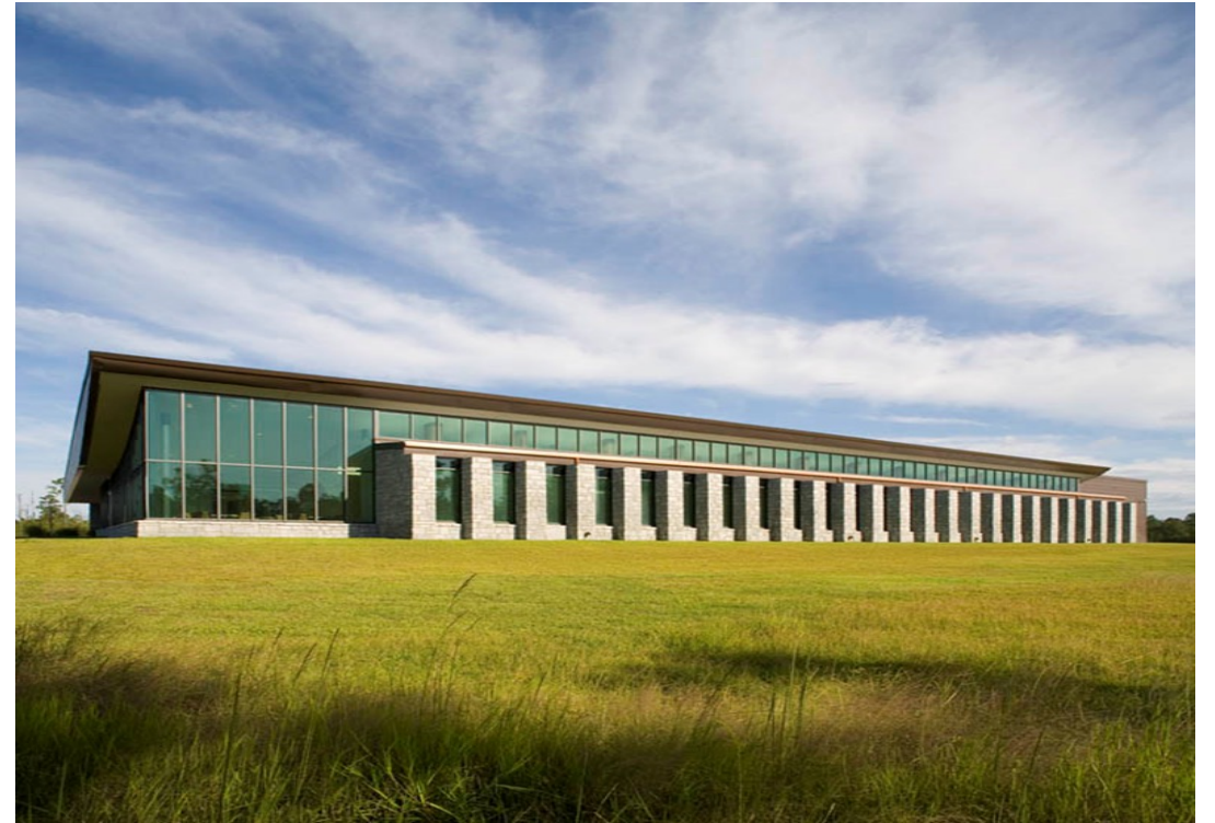
GPHL – Waycross established in 2007