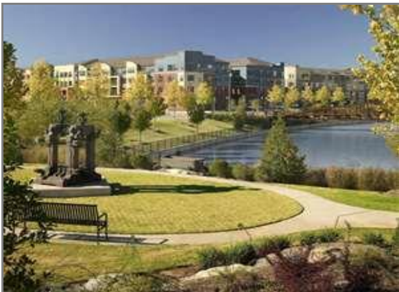
The Atlantic Station complex, formerly Atlantic Steel Company, after brownfields redevelopment.

Providing Public Health insight for brownfields redevelopment can not only reduce the potential for chemical exposures, but also encourage healthy behaviors and improve quality of life. For example, turning a brownfield into green space can increase physical activity by providing walking paths and other recreational areas. As a result, the rates of diabetes, heart disease, and obesity may be reduced. Green space and walking paths may also help reduce vehicle traffic and, thus, air pollution and the rates of asthma and other respiratory diseases. And, redeveloping land that was once contaminated may improve the sense of well being in communities through involving residents in positive growth and change.