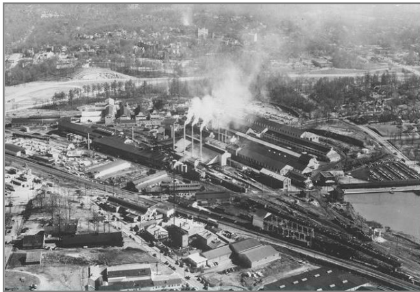
The Atlantic Steel Company in downtown Atlanta before brownfields redevelopment.

Local and state health departments evaluate community concerns and health and environmental data to determine whether the property poses any health threats to the public before, during, and after a brownfield clean up and redevelopment.