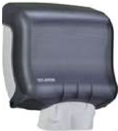
Standard Manual Paper Towel Dispenser