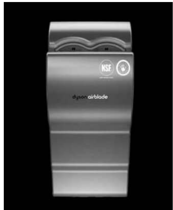
Air Blade Technology