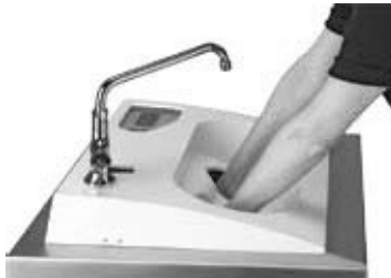
Counter or Table Mount Unit

Examples of Automatic Handwashing Stations