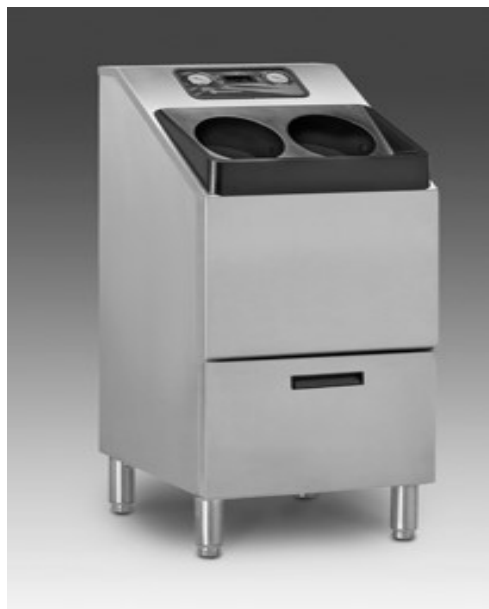
Hand Cleaner and Sanitizer Inside of Cabinet