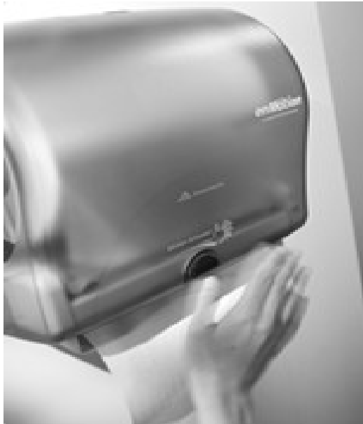
Infrared Sensor Activated Paper Towel Dispenser