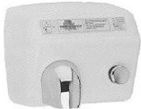
Hot Air Dryer