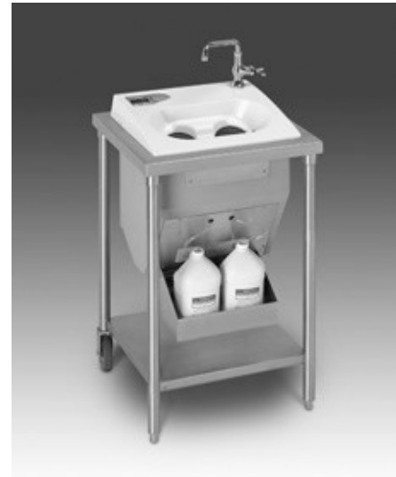
Unit with hand cleaner and sanitizer exposed.