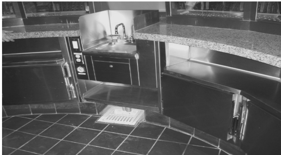
Shielded Handwashing Sink located in the Food Preparation Area.