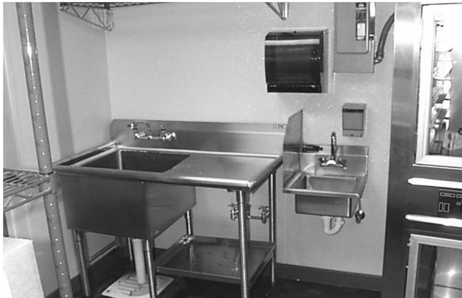
Shield Attached to Handwashing Sink providing splash protection for Food Preparation Sink

Examples of Cross-Contamination Prevention at Handwashing Stations