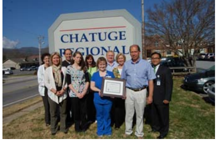
Chatuge Regional Hospital