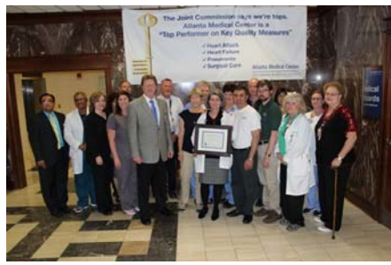
Atlanta Medical Center