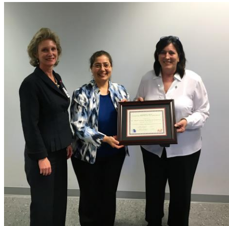
St. Mary's Good Samaritan Hospital