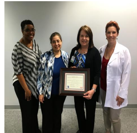
Clearview Regional Medical Center