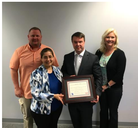
South Georgia Medical Center