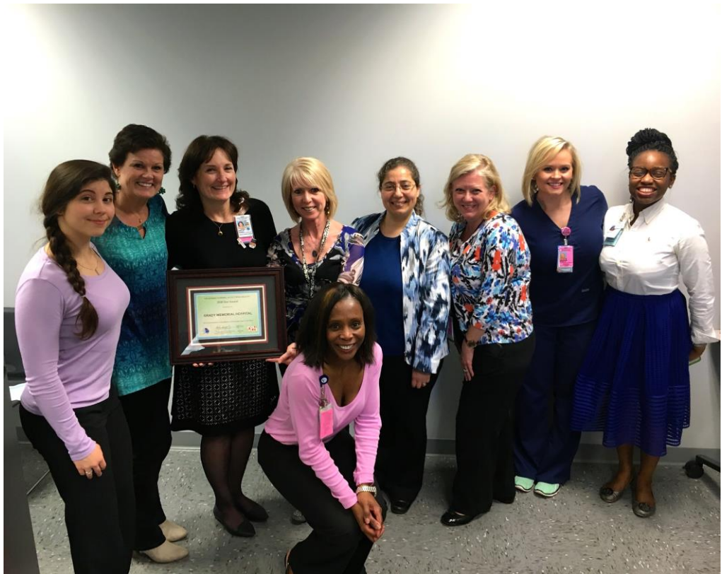
Grady Memorial Hospital – Hospital Star Award Recipient