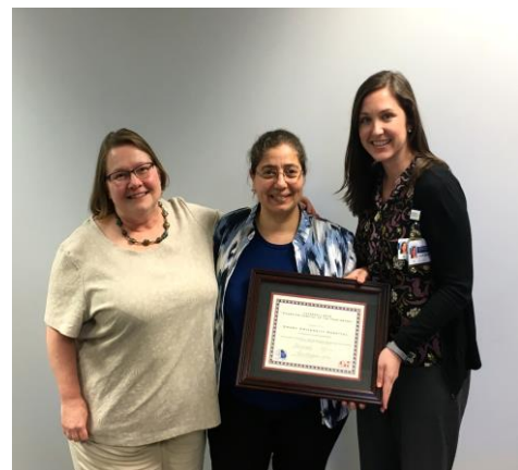
Emory University Hospital