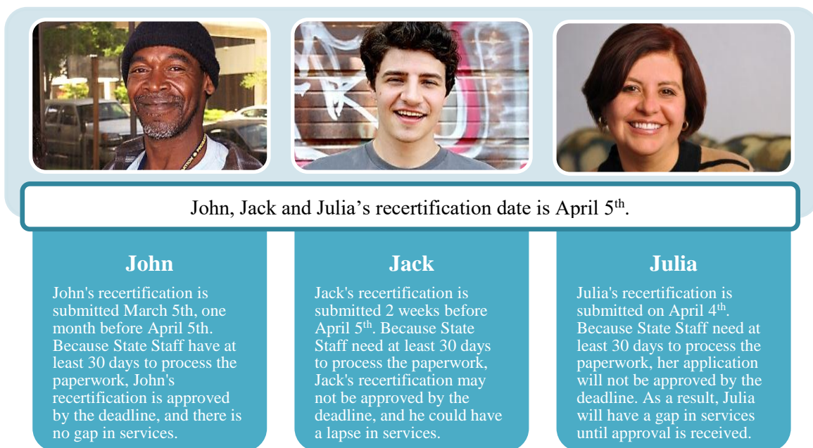
Figure 3. Recertification Scenarios