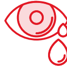
RED, WATERY EYES