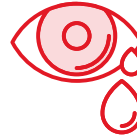
RED, WATERY EYES