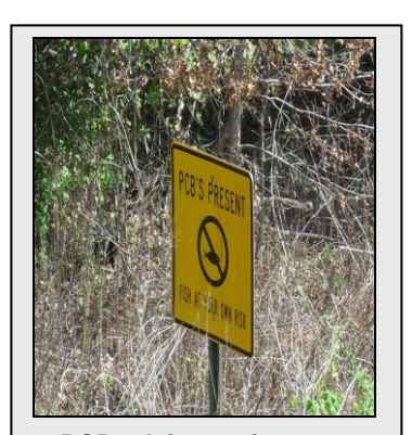
PCB advisory sign near Rocky Creek

Armstrong World Industries, Incorporated, in south Macon was added to EPA's "Superfund" National Priorities List for release of PCBs and other contaminants to soil and sediment. Elevated levels of PCBs were found in on-site landfills, drainage pathways, and Rocky Creek. During the late 1990's, fish tissue analyses was conducted for a variety of species caught in Rocky Creek and the Ocmulgee River several miles downstream of the Armstrong site. Results indicate that if residents regularly eat fish caught in Rocky Creek at locations south and southeast of the Armstrong site sources, the calculated exposure dose for adult recreational anglers can be up to 23 times higher than the health effects guidance value, and the calculated exposure dose for a child eating half the adult amount can be up to 50 times higher than the health value. Individuals who ate, or are currently eating fish caught in Rocky Creek south and southeast of the Armstrong site could have been and could be currently exposed to PCBs at levels that could harm their health.