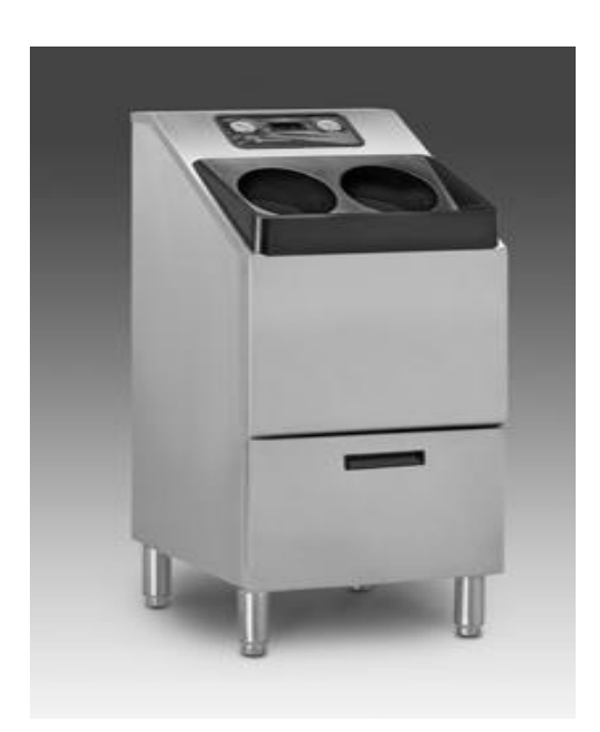
Hand Cleaner and Sanitizer Inside of Cabinet