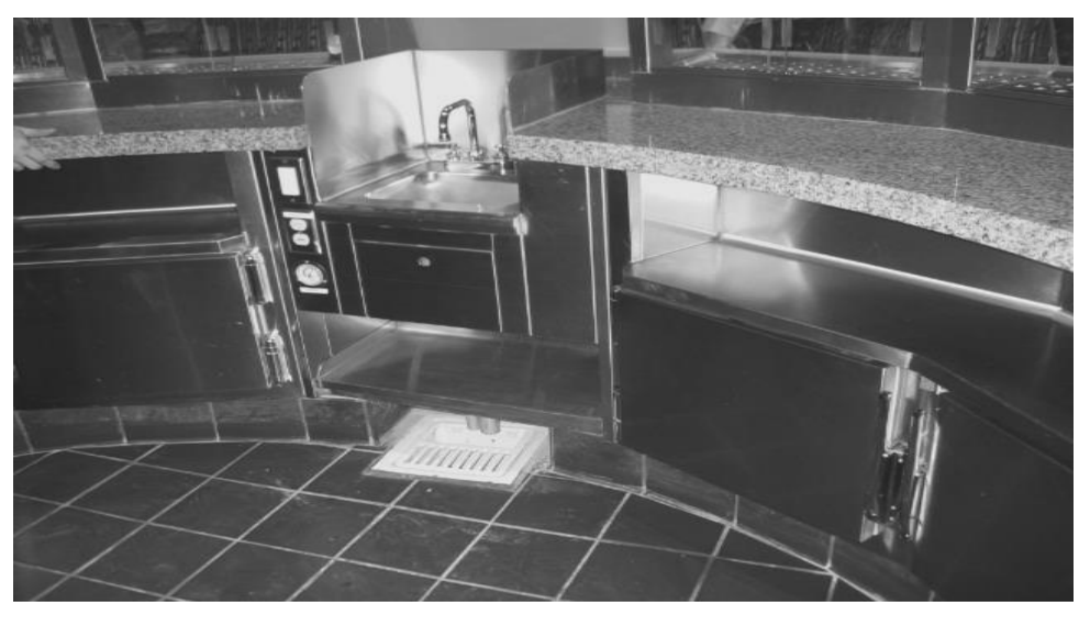
Shielded Handwashing Sink located in the Food Preparation Area.