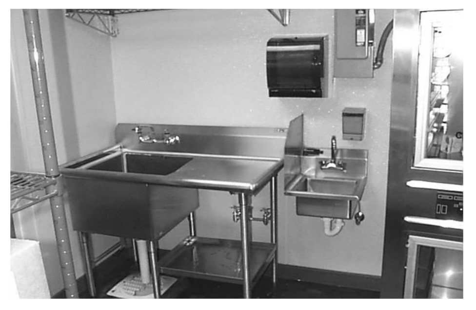
Shield Attached to Handwashing Sink providing splash protection for Food Preparation Sink

Examples of Cross-Contamination Prevention at Handwashing Stations