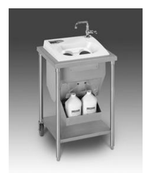
Unit with hand cleaner and sanitizer exposed.