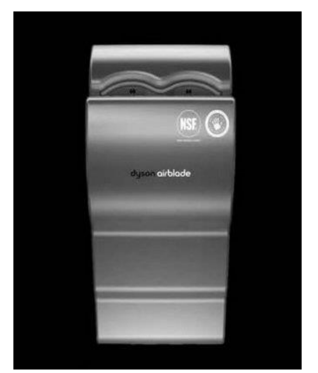
Air Blade Technology