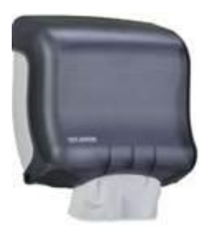
Standard Manual Paper Towel Dispenser