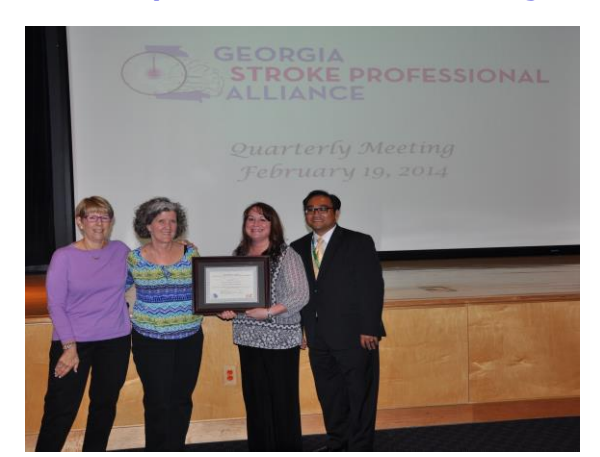
Atlanta Medical Center