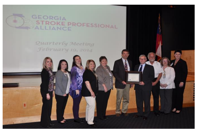
Habersham Medical Center