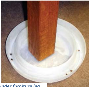
Interceptor device under furniture leg.